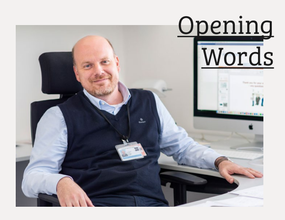
Dear colleagues, dear friends,

this year is very special for us. Ten years ago on April 1, 2014, the story of the Health Research Council of the Czech Republic (AZV ČR) began to be written, a story in which many personalities of the Czech health care and medical research have participated over the years and are still participating, who are trying to cultivate and develop it so that it can continue to be written – and for this they deserve a great thanks.